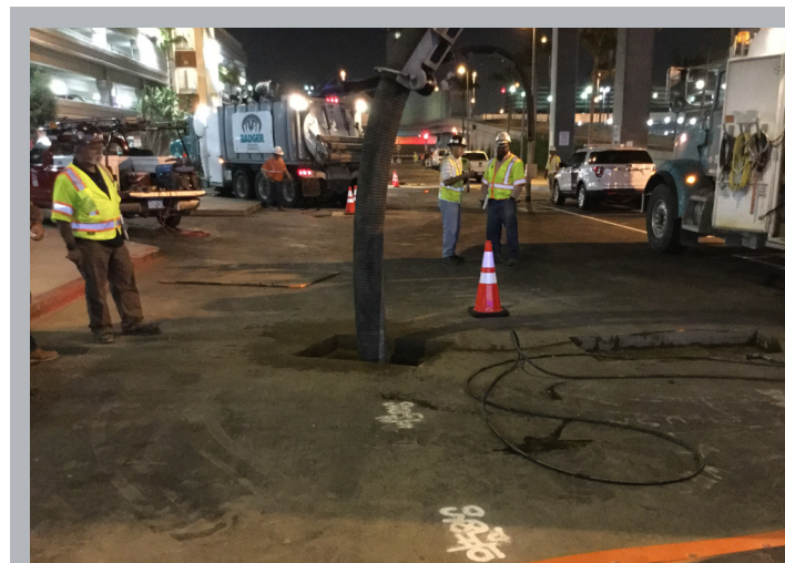
Utility information was obtained by using vacuum trucks to avoid utility strikes.