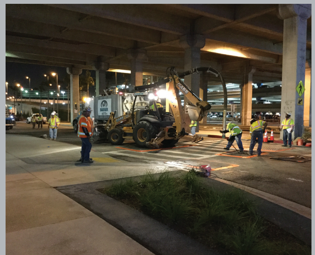
Our Underground Division crews managing pothole operation in the Central Terminal Area.

Griffith Company is an equal opportunity employer and an employee-owned company.