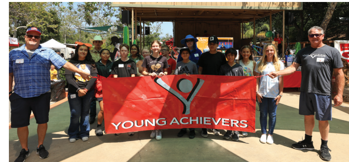
Young Achievers – Jr. High