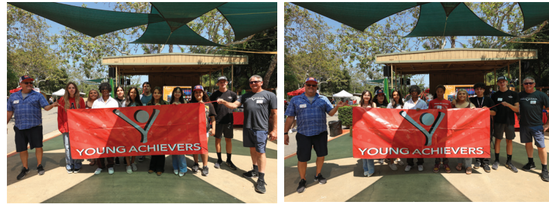
Young Achievers – High School