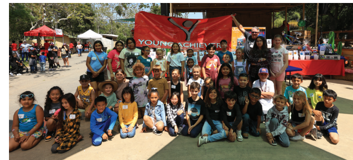
Young Achievers – Elementary