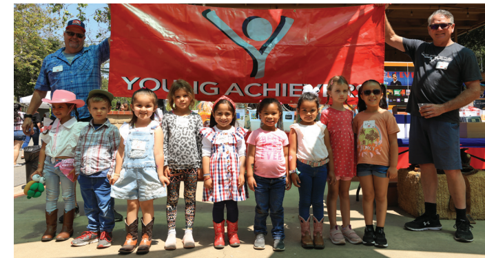
Young Achievers– Kinder