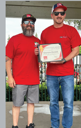
Best of the Best Structure Division

The "Best of the Best" award for 2023 went to the Structure Division (D70) with solid safety metrics across the board. They showed great improvement and authentic engagement with Task Hazard Analysis and Safety Observations. Honorable Mention went to the Southern Division (D10), and Underground Division (D60) for improving safety results from the previous year.